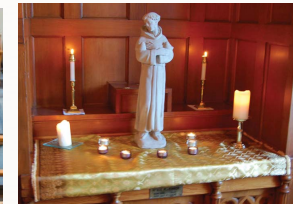
Daily Offices and Personal Prayer