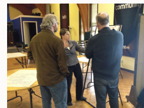
Seeking God: The Way of St. Benedict