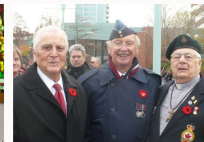
Remembering the past, living in the present, looking forward to the future