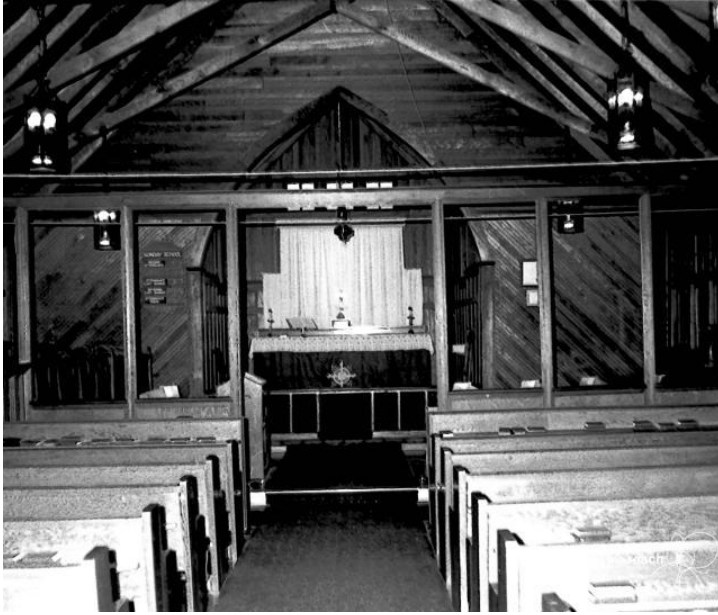
The Reach Photo Archives 19549